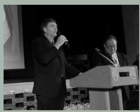
Lamers Bus Lines